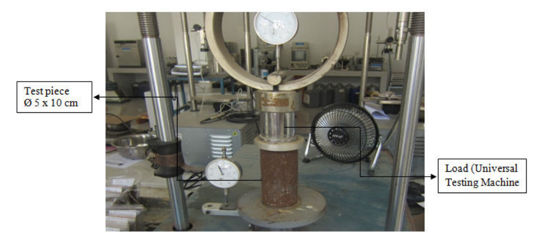
Figure 1. Equipment of Compressive Strength, Elasticity and Poison Ratio Test in Laboratory

After the mixture composition design is made, the next step is to examine the characteristics of the mixture of clay and lime in the form of specific gravity and sieve analysis. The specimens are made from clay and lime which has been tested according to the standard mixed based on the results of the design of the mixture with a ratio of 1: 1 with a moisture content of 35%. Test specimens that have been made are then subjected to treatment of test specimens namely water and air curing for 7 days.