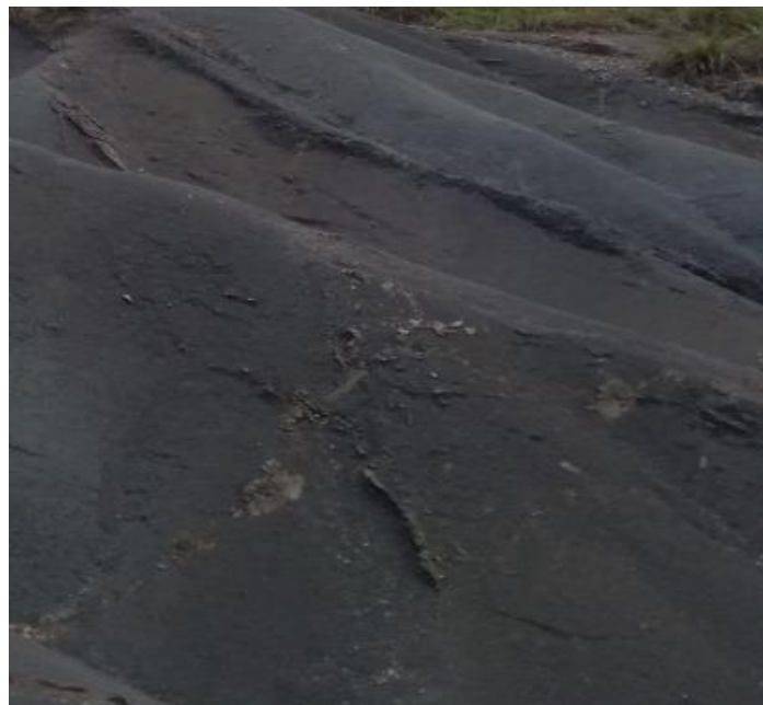
Fig 1: Visual observation of Mountain sand