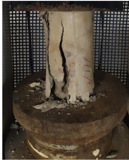
Fig 2: Compressive strength test equipment