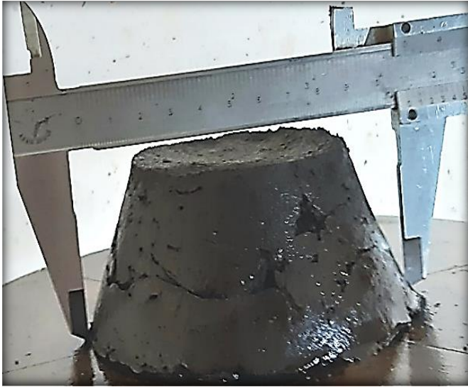
Fig. 3 Flow testing of geopolymer mortar materials