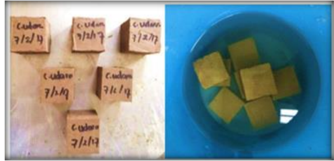
Fig. 1 Treatment process (curing) of the test object

SNI-03-6825-2002 [32] describes compressive strength testing, which involves placing a specimen between two loading rods and constantly applying a continuous monotone load to create compressive stress.