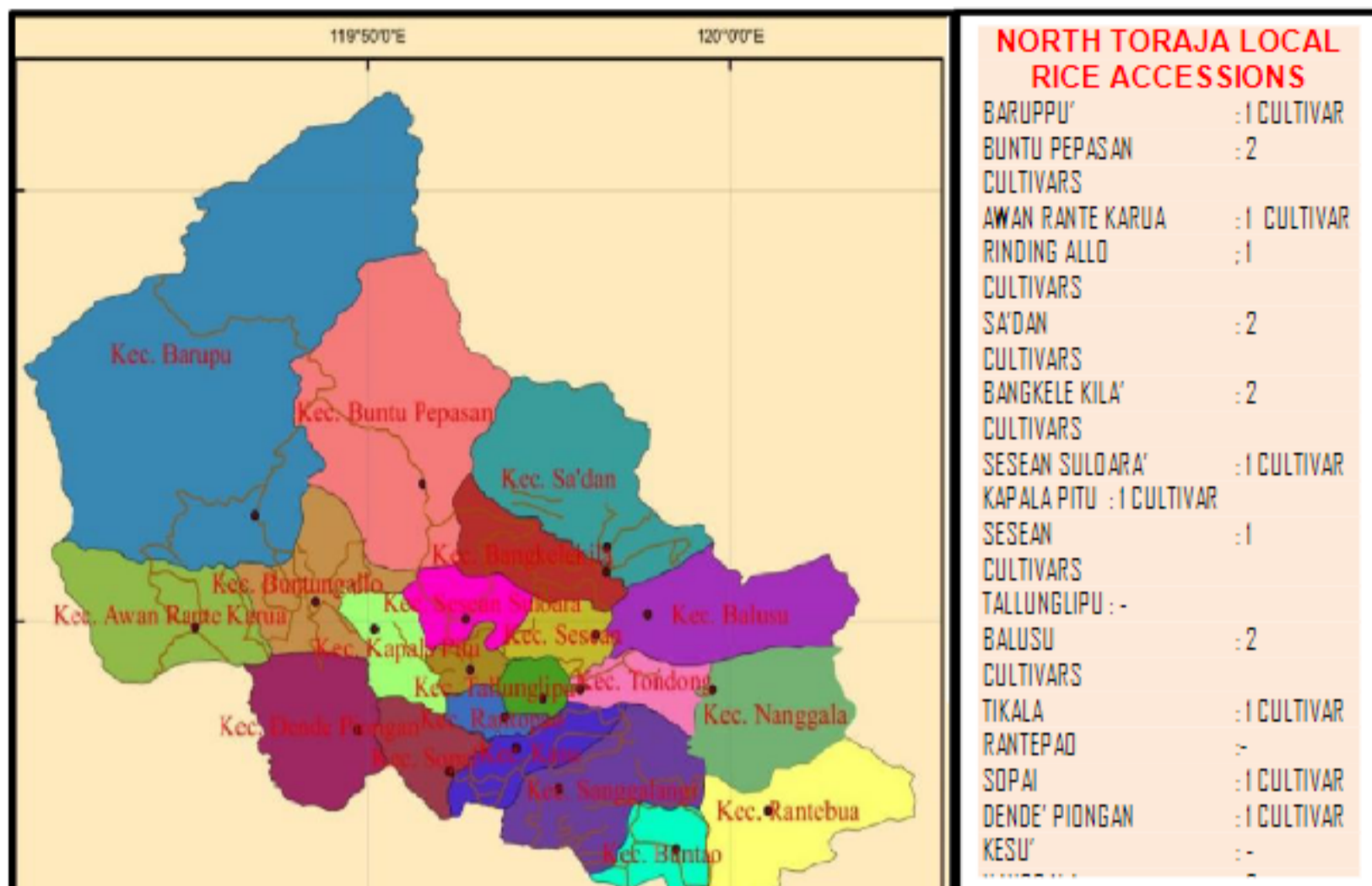
Figure 1. Map of the distribution of North Toraja local rice accessions.

Meanwhile, North Toraja people generally classify rice based on grain loss ( Pare Tambak and Pare kutu' ), the color of rice ( pare lottong, pare mararang and pare mabusa ), and based on the age of planting.