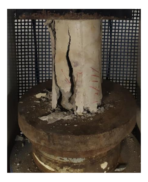
Fig 2: Compressive strength test equipment