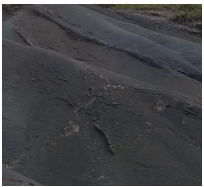
Fig 1: Visual observation of Mountain sand