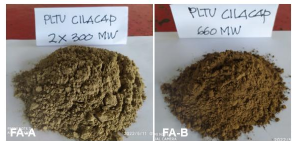
Figure 1: Fly ash

Figure 1 shows the physical appearance of each fly ash used in this research. It was taken from two different sources of power plant units, namely FA-A from steam power plant Cilacap Indonesia 2x300 MW, and FA-B from steam power plant Cilacap Indonesia 1x600MW.