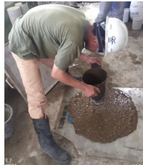
Figure 2: Slump flow tested

form of a cylindrical specimen measuring 100 mm x 200 mm which had been examined with water submerged curing. The compressive strength test of the specimen is carried out with a compression test apparatus as shown in Figure 3, with the procedure referring to ASTM C39 [13].