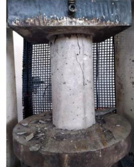
Figure 3: Compressive tested