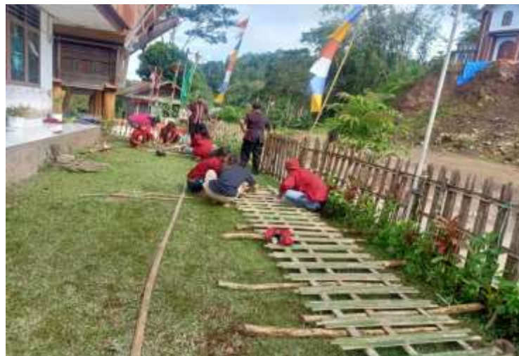
Figure 3. Arrangement of space boundaries of roads and fences