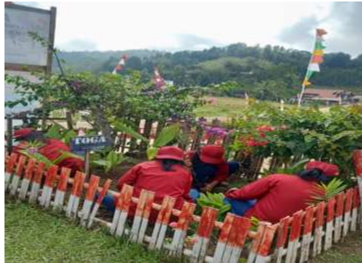
Figure 4. Revamping the Family Medicinal Plant Room

Lilikira' Village potential, is all natural resources and human resources found in the village. Where all these resources can be utilized for the sustainability and development of the village. When we hear the word village potential, it must immediately lead to a village that will be developed into a tourist village. But actually not only that, but also other sectors such as economy, education, social, environment are also developed.