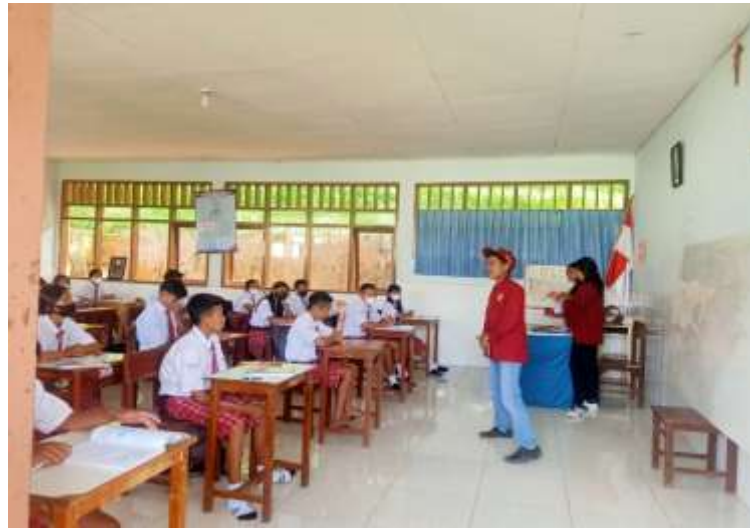
Figure 6. Study Assistance at Renya Rosari Lilikira Catholic Junior High School