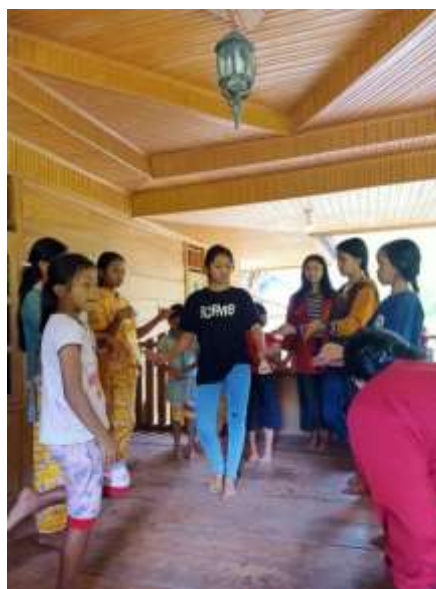
Figure 2. Dance Tutoring for Children