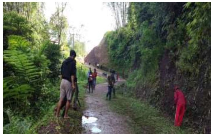
Figure 5. Village Road Measurement and Cleaning

Lilikira' Village potential, is all natural resources and human resources found in the village. Where all these resources can be utilized for the sustainability and development of the village. When we hear the word village potential, it must immediately lead to a village that will be developed into a tourist village. But actually not only that, but also other sectors such as economy, education, social, environment are also developed.