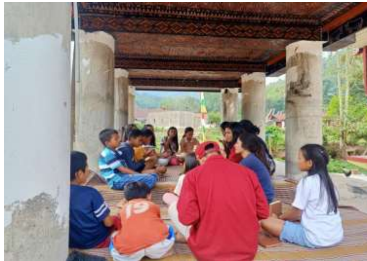
Figure 7. Tutoring in Tongkonan