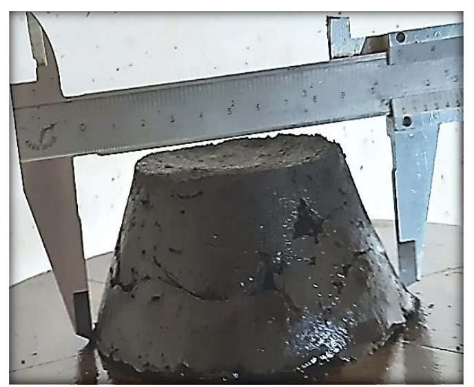
Fig. 3 Flow testing of geopolymer mortar materials