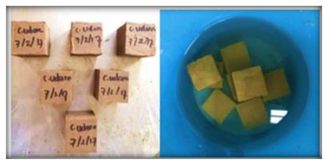
Fig. 1 Treatment process (curing) of the test object

SNI-03-6825-2002 [32] describes compressive strength testing, which involves placing a specimen between two loading rods and constantly applying a continuous monotone load to create compressive stress.