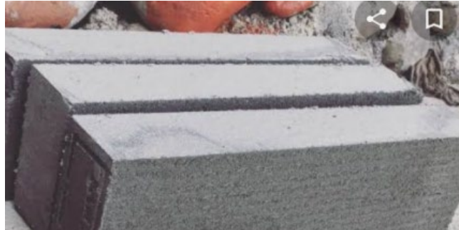
Figure 1. Cellular Lightweight Concrete (CLC)

these investigations. It was shown that the compressive strength and indirect tensile strength of foam concrete could be maximized by utilizing silica sand and adding calcium. White dirt was found to boost the compressive strength of lightweight bricks in a study by Amran et al. (2015 [11]), which looked at the experimental examination of the compressive strength and water absorption of CLC with that material as an aggregate.